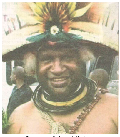
Our new Prime Minister James Marape In traditional dress And in general he said: "May I ask one thing from all our citizens? Give me a good law and order environment. Stop crime, stop tribal fights – my Hela province! -, stop torture of mothers and daughters, stop corruption at all levels, honour time by being punctual, do little things like stop littering and spitting the red stain of betel nut."

In his first message to the people of PNG he addressed corruption and bribery.