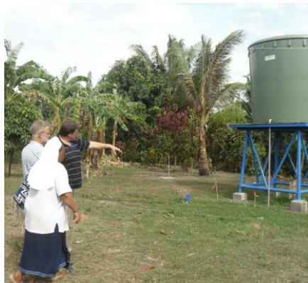
The water tank project for the Back Road church, also finished, thanks to our benefactors.

But of course, a church building is not enough. The dream goes on following the footsteps of the real Christ, then a primary school, so that children don't have to go far from their homes for their basic education, and - if possible - a little health center! And for all that, ground has to be purchased.